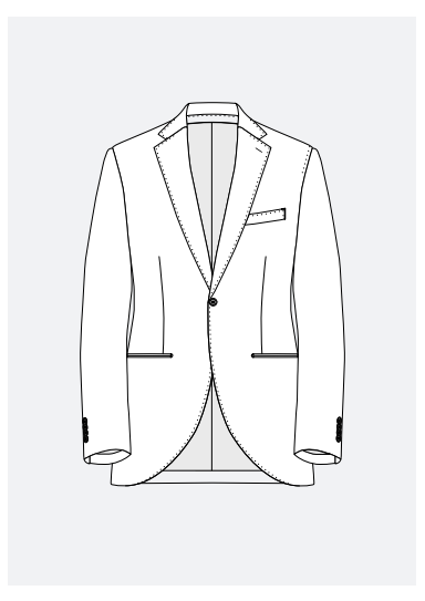
Short morning jacket