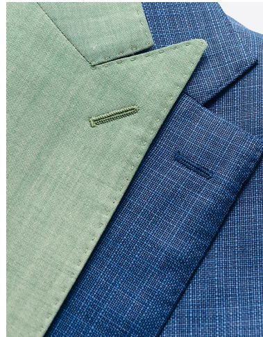
EVE034 & WEDS021