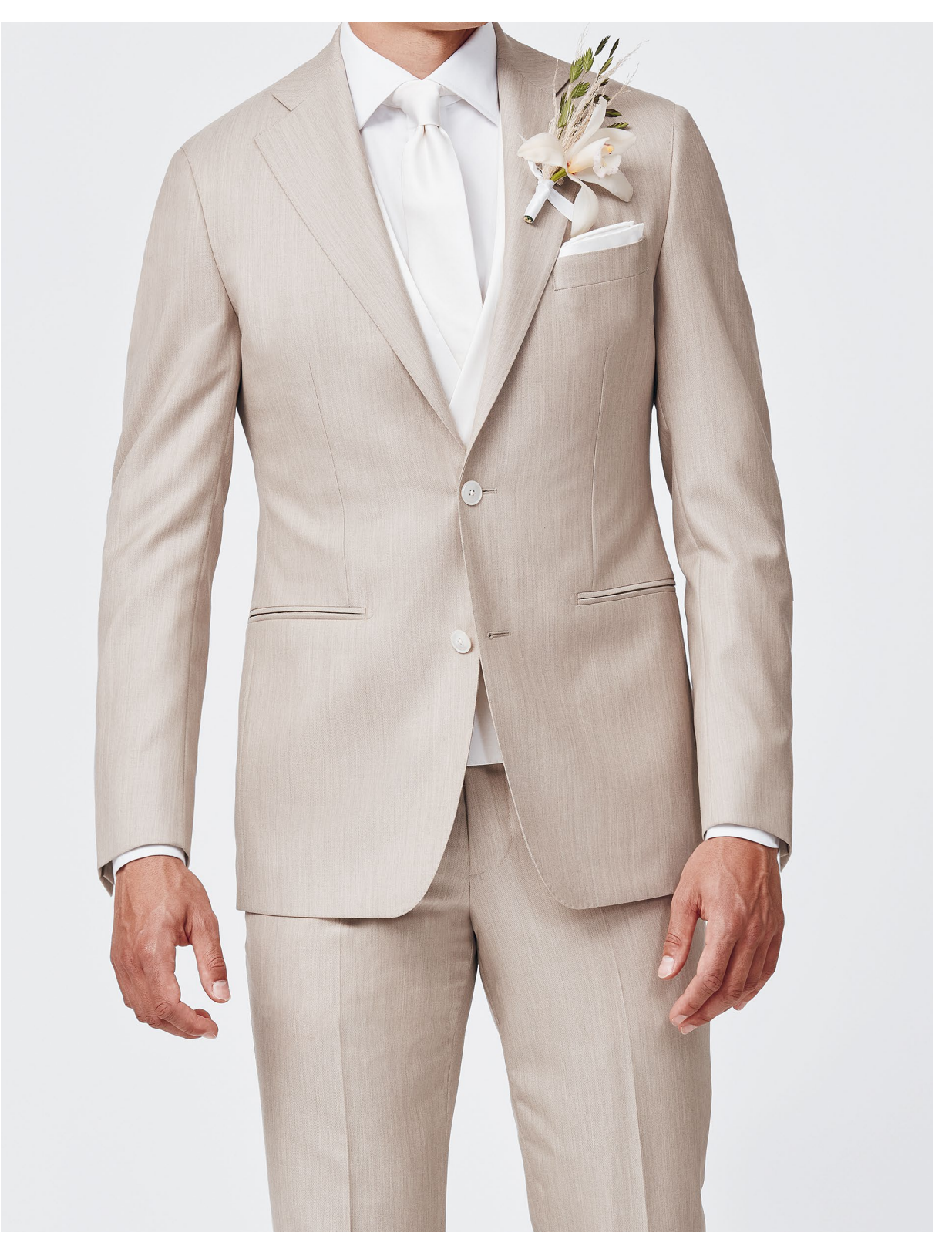
A sandy coloured 2-piece suit paired with an ivory waistcoat and matching accessories.