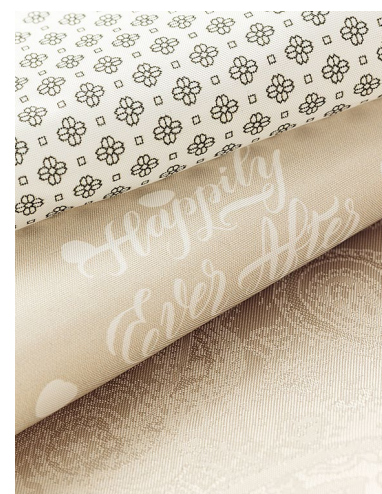
Fancy 443, Fancy 404 & Jacquard champagne 8502