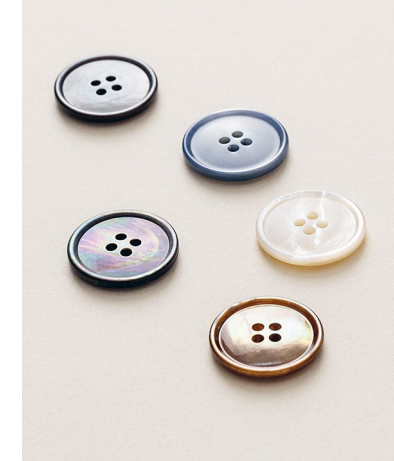
Buttons 10, 11, 12, 15 & 51